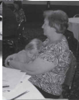
Future Wings Member